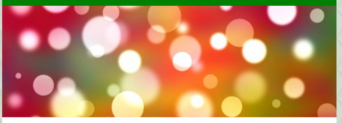
Lilly's Cleaning Service May