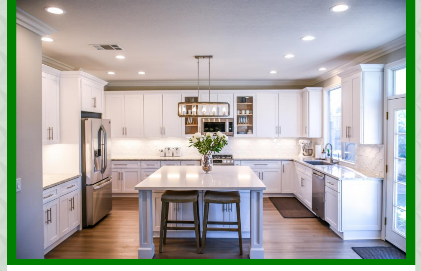
16 Ways to Organize Your Home Like a Professional