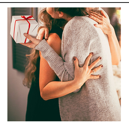
Click On The Image To Purchase A Gift Card

Give Peace of Mind and Relaxation Give The Gift of Freedom Give Lilly's Gift Card