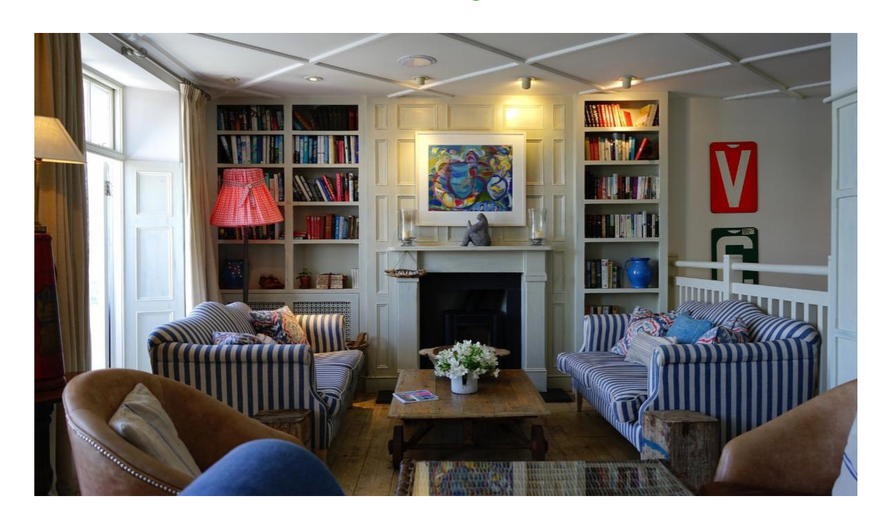
Smart, Stylish, And Practical Room Organization Ideas